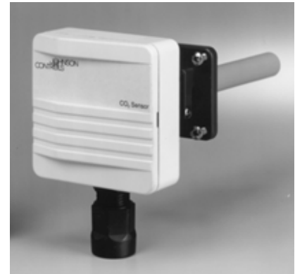
Duct Mount Transmitter with Conduit Adaptor and Mounting Flange