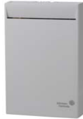
CD-W00-00-2 Wall Mount CO 2 and Temperature Transmitter