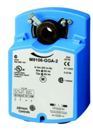
M9106-xGx-2 Series Electric Non-Spring-Return Actuator

Refer to the damper or VAV box manufacturer's information to select the proper timing for the actuator. Refer to the appropriate application note for specific wiring diagrams and information.